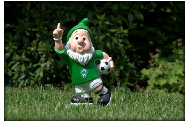
From upper right (clockwise): Iron Throne from 'Games of Thrones', garden gnome, malachite (mineral), Fabergé egg